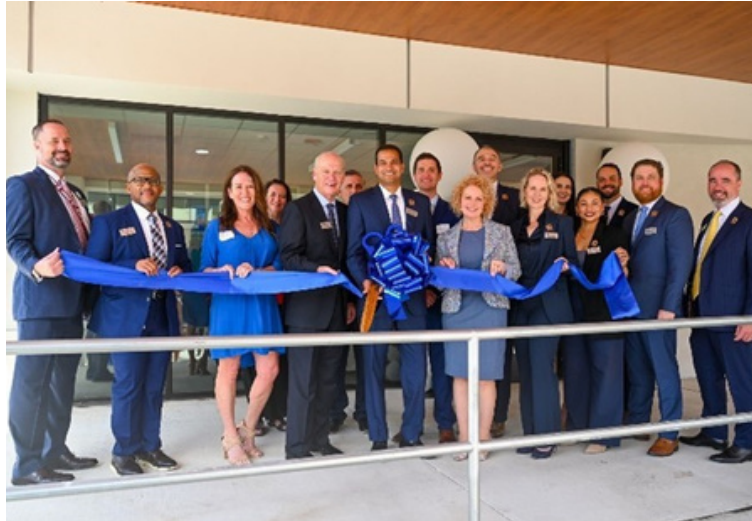
The Medical Center

We opened Gulf Coast Blood – The Medical Center, a new donor center created with input from our incredible donors. This center symbolizes our organization's growth and our continued commitment to serving the community.